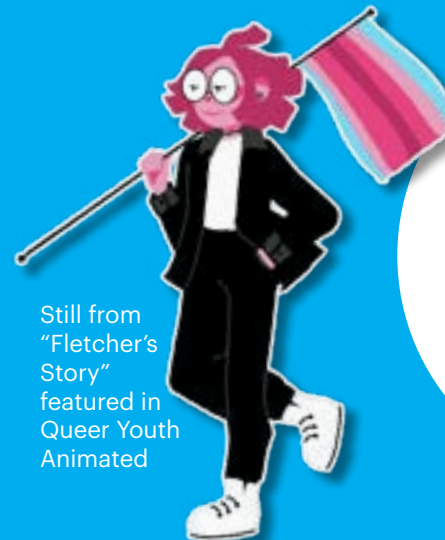
Still from “Fletcher’s Story” featured in Queer Youth Animated

—Fletcher (Kansas City, MO) Queer Youth Animated Storyteller